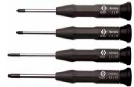
4839 XM screwdriver set

Set of 4 Precision screwdrivers. Containing one of each of T4880X 1.5 x 60, 2.5 x 75, 3.0 x 100mm Slotted. T4882 Ph 0 x 60mm Phillips.