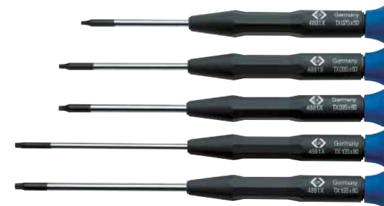
4881 XM screwdriver set