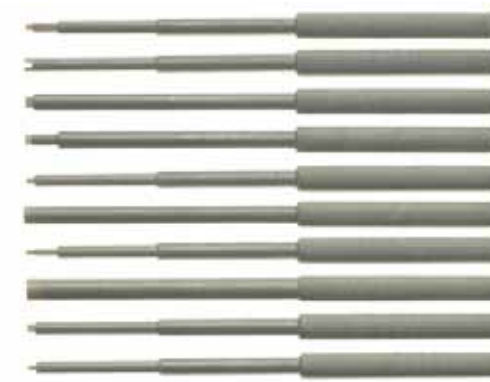
4857 Trimmer tool set

4 ceramic blades in 1 tool. The blade inserts can be used as mini alignment tools.